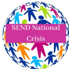
SEND Community Alliance